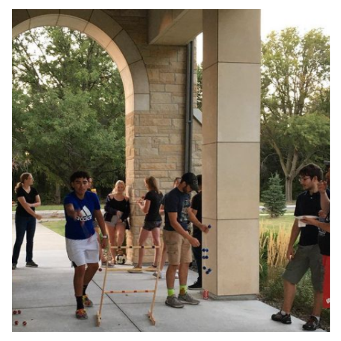
Photo from a September get-together with pizza and lawn games. Follow us on Instagram @fhsuhonorscollege for more updates!

So if the first floor still smells like a river, that's why.